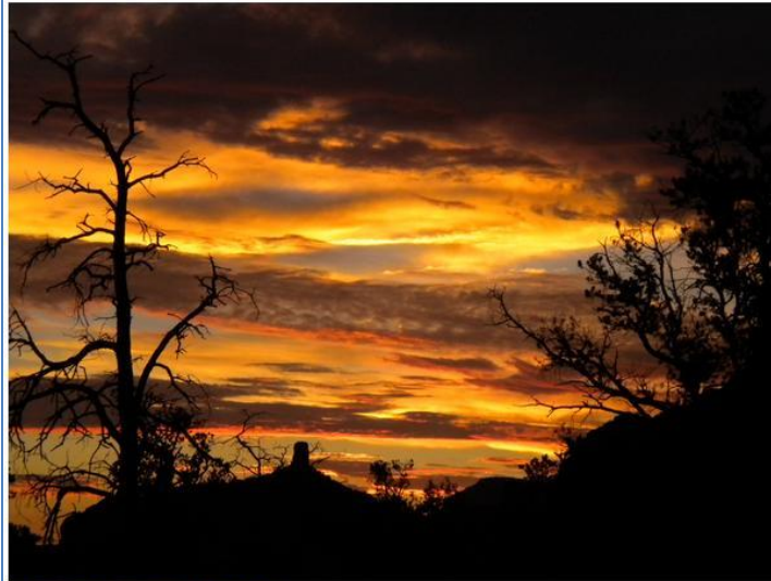
Caption: The sky at night in Sedona

Note: If your mouse pointer appears as a hand when you move it over a picture, left-click your mouse to have Google Earth show the location of where the picture was taken